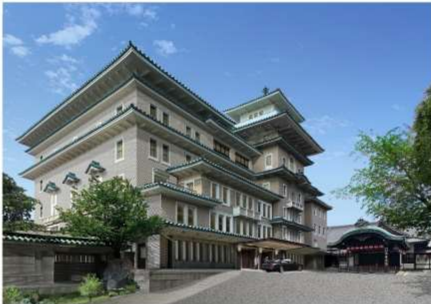
Photo: The current Main building's southwest exterior (preserved part)