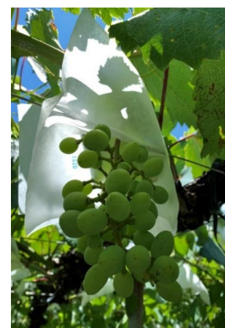
The winery's Koshu grapes

After lunch, your chauffeur will drive you to the incredible vineyards of the Katsunuma and Shioyama regions. These regions are characterized by scenes of vineyards dotted across every surface, from mountain slopes to flatlands. You are sure to always remember the view like a beautiful painting, with tree colors that shift according to the season and refreshingly clear air.