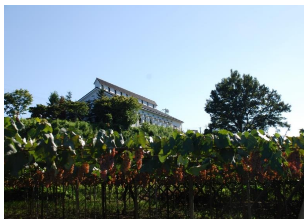
Restaurant Kaze viewed from the vineyard

Example: For two guests in the Crown: ¥153,000 For four guests in the Alphard: ¥236,000