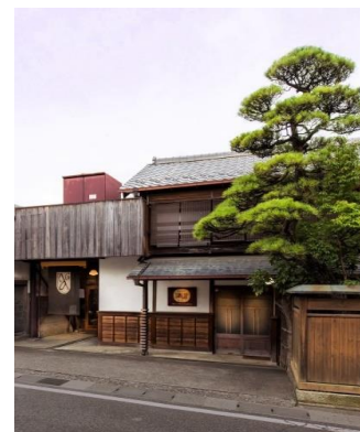
Katsunuma Winery's main building

In the airy restaurant interior with a high ceiling inspired by Nagasaki's famous Oura Cathedral, consider the delectable wine and food pairings devised by these winemakers and enjoy magnificent views of the vineyard outside.